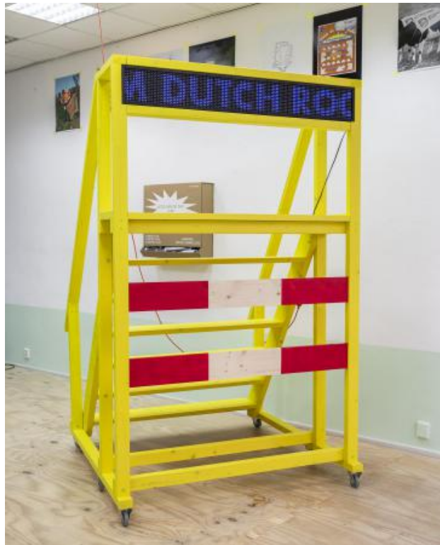
untitled, 2023 mixed media, aprox 150x130x210cm