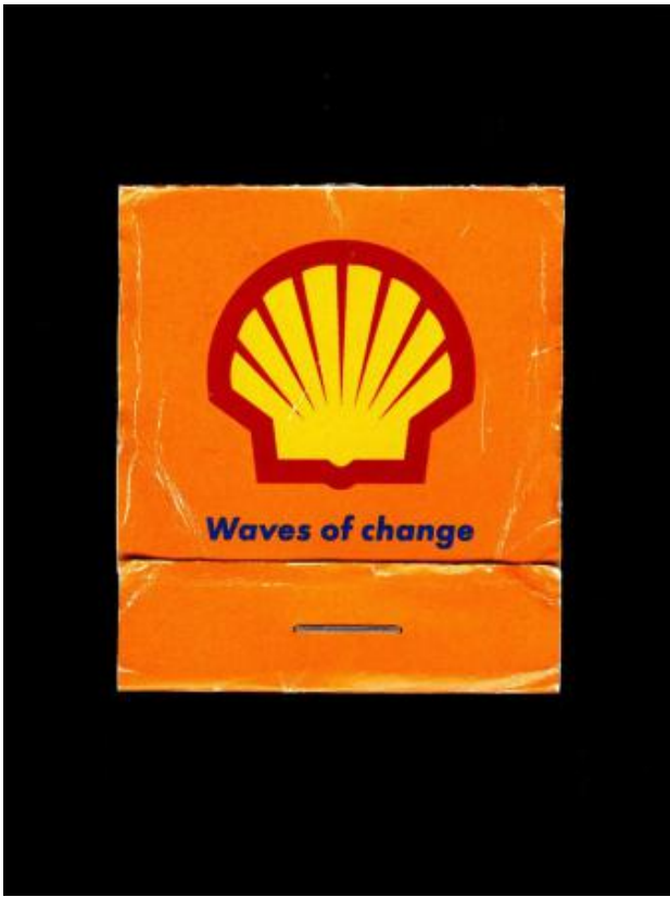
untitled, 2023 mixed media