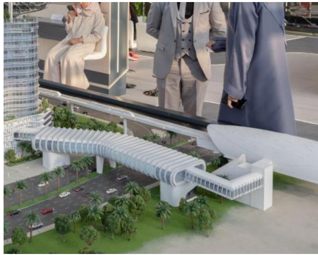
untitled, 2023 Photography