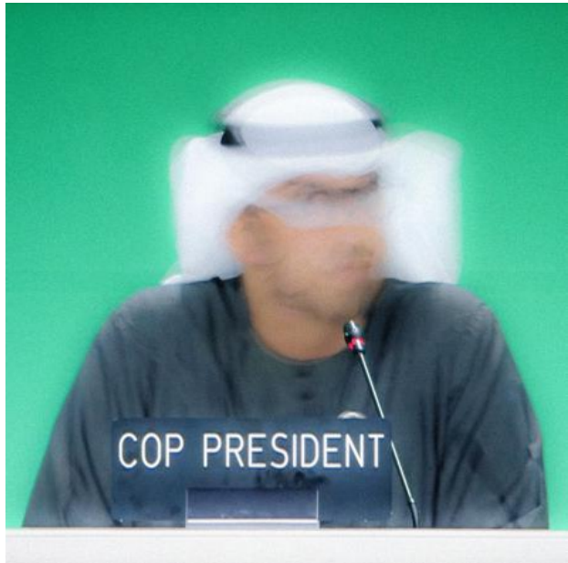
untitled, 2023 Photography