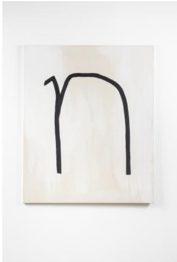
u, 2024 Acryl on Canvas, 120 x 100 cm