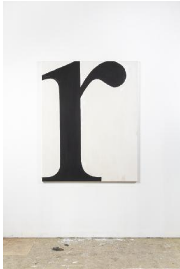
"When r becomes a memory", 2024 Acryl on Canvas, 150 x 120 cm