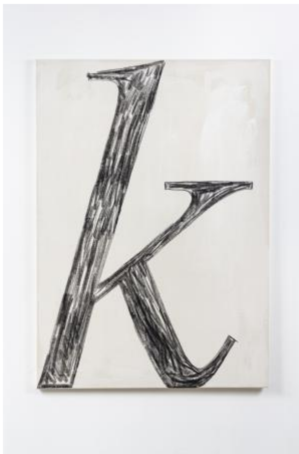
k, 2024 charcoal on canvas, 140 x 100 cm