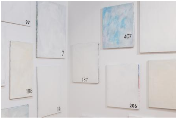
bookpages, 2024 Mixed media, variable