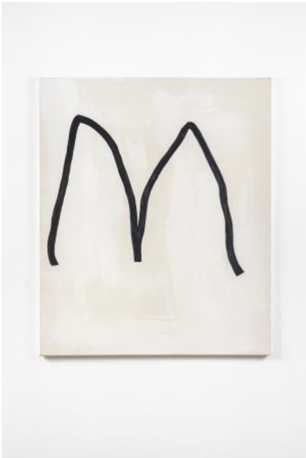
w, 2024 Acryl on Canvas, 120 x 100 cm