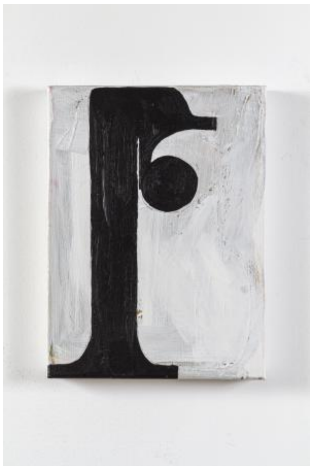
'i is haar punt kwijt', 2024 Acryl on canvas, 40 x 30 cm,