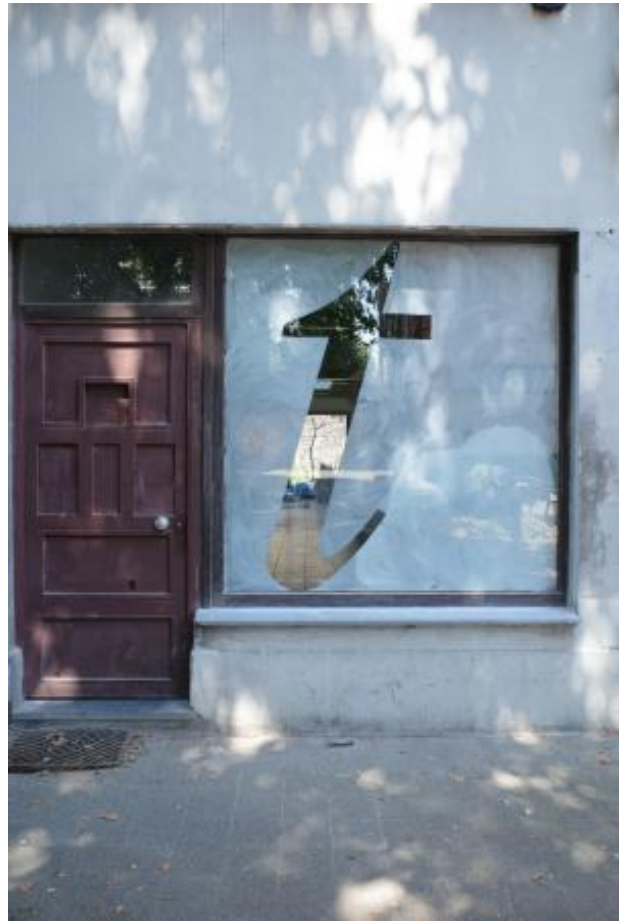
t for T-space, 2024 kalktekening op raam, 2 x 2 m