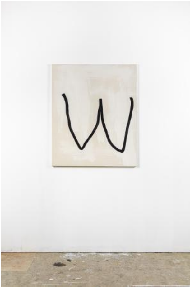
m, 2024 Acryl on Canvas, 120 x 100 cm