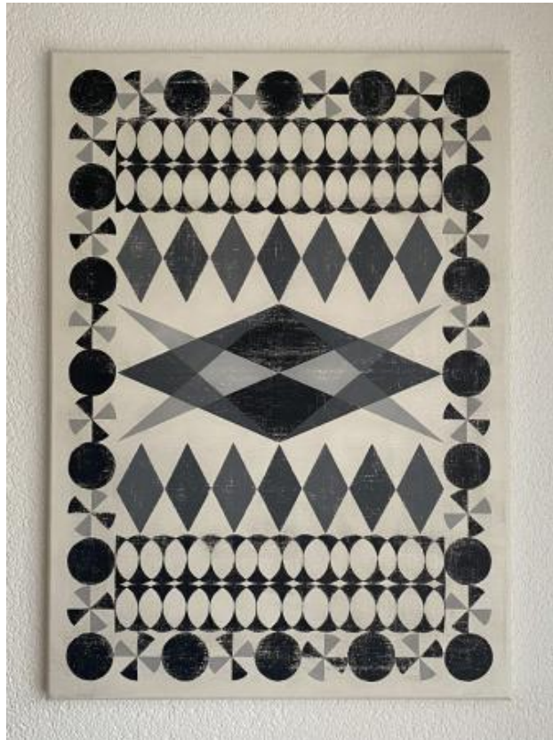
Energy template. 2, 2021 acrylverf, 50x60cm