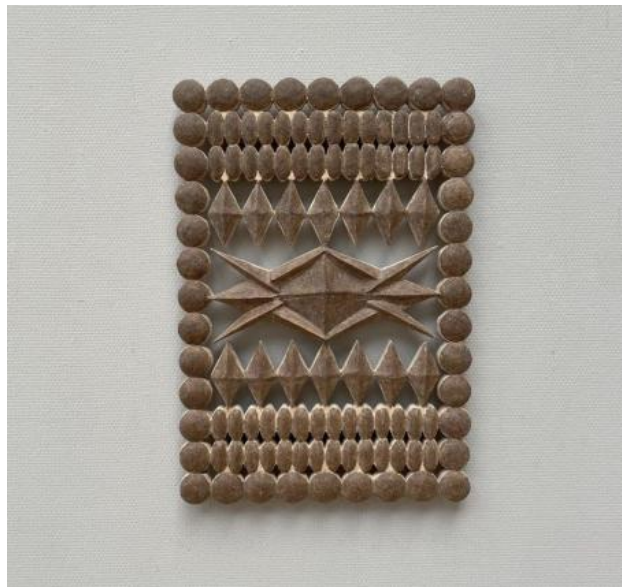
Energy Talisman, 2023 Wood, 50x60cm