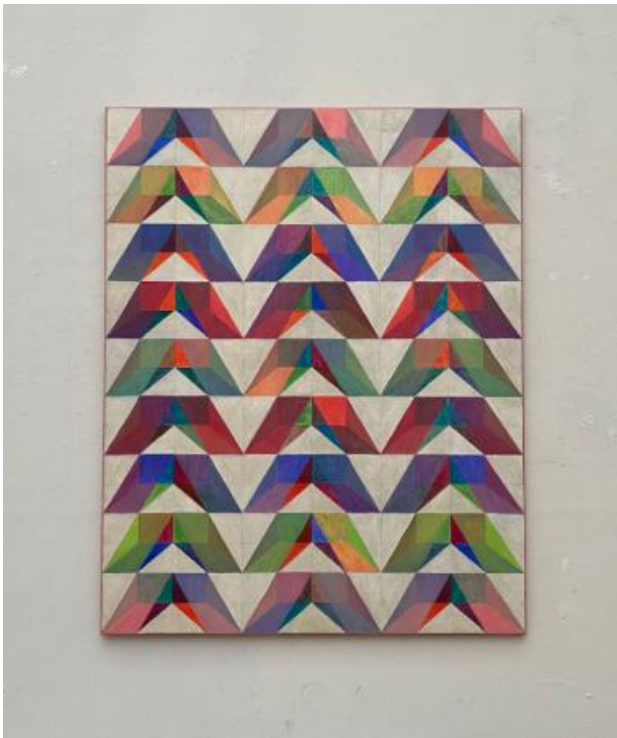
Rhythm of 3D Triangles, 2024 Pencil and oil paint, 120x150cm