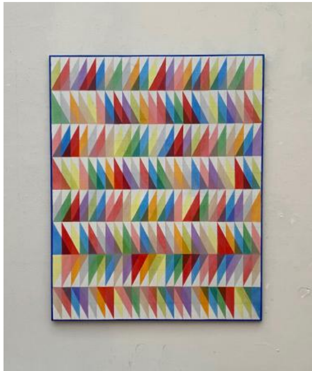
Triangle Sequence Nr.2, 2024 Oil paint, 120x150cm