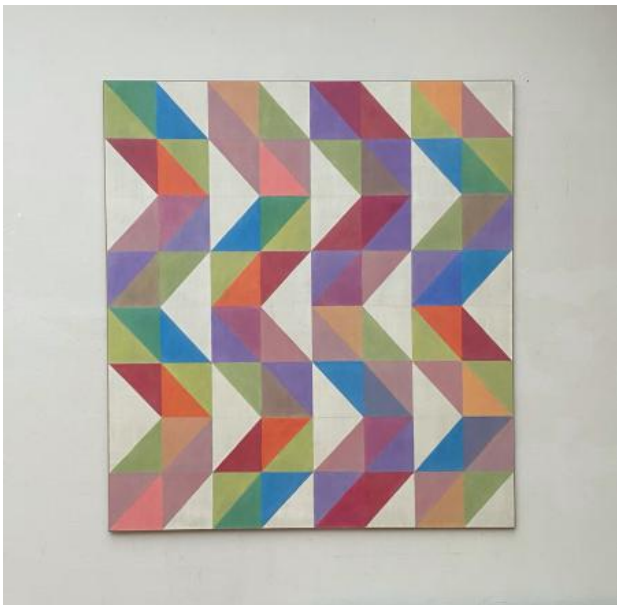
Rectangular dance.1, 2024 Oil Paint, 200x220cm