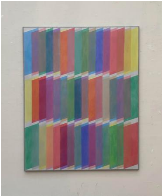
Panels, 2024 Oil paint, 120x150cm