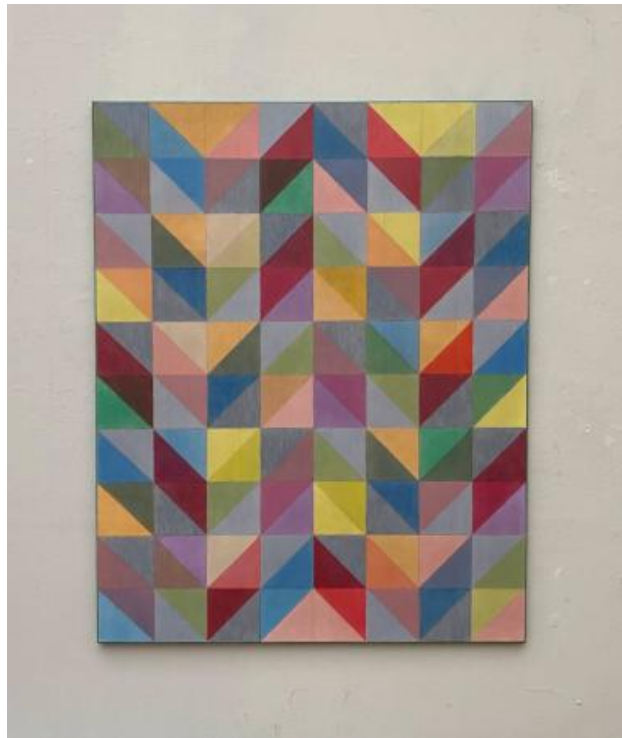
Rectangular Rhythm, 2024 Oil paint, 120x150cm