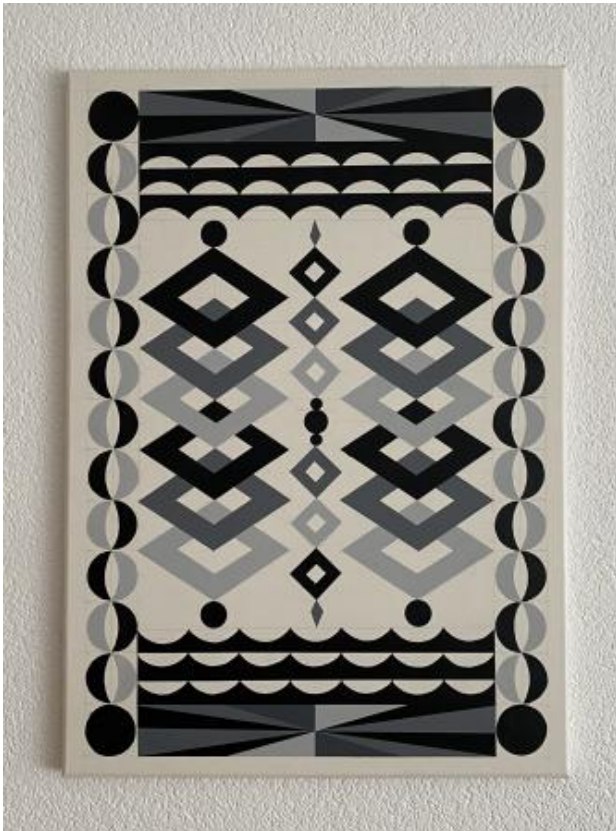
Energy template.1, 2021 acrylverf, 50x60cm