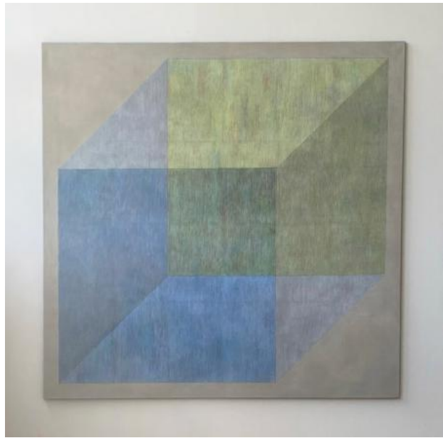
Cube. Nr.2, 2024 Pencil and oil paint, 180x180cm