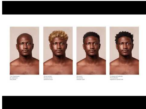
Lissom, 2021 6:01