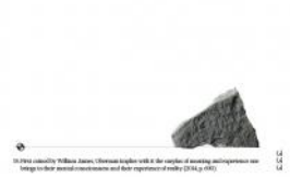
faith in the darkness of being, 2023