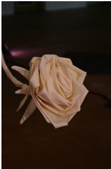
اشتلاخ - 2023, 70,000 Folded cotton textile, metal wire, 40 x 20 x 20 cm