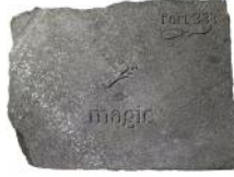
faith in the darkness of being, 2023

The unconscious lives in one's own darkness. One can be in unaware of its happening as it is important to the psyche. It is no easy feat to try to comprehend it, for this reason we have symbols, myths and religion, according to Carl Jung, in Man's soul the symbols, human consciousness has been developed by man over a long and tedious process which took ages to reach its current state. Still, this evolution has yet to be completed and "large areas of the human mind are still shrouded in darkness" (2004, p. 23) Occult practices, however, like the tarot and astrology alongside religious practices can aid such unveiling.