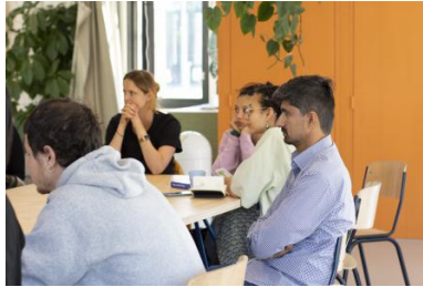
Critical care reading, 2024 Experimental tarot reading workshop