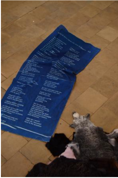
, 2023 Cyanotype print on textile, 40 x 105 cm