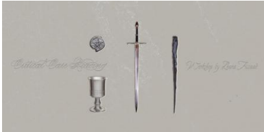
Critical care reading: Experimental tarot reading workshop, 2024 Workshop Installation