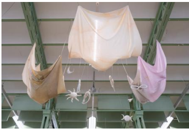
اشتلاخ - 2023, 70.000 Naturally hand-dyed textile, machine-sewn stuffed textile shapes, 200 x 200 cm