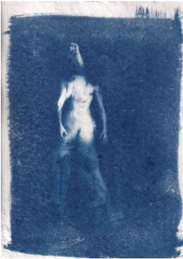
Feel free to talk to plants, 2024 cyanotypie