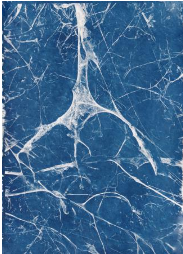
Feel free to talk to plants, 2024 cyanotype