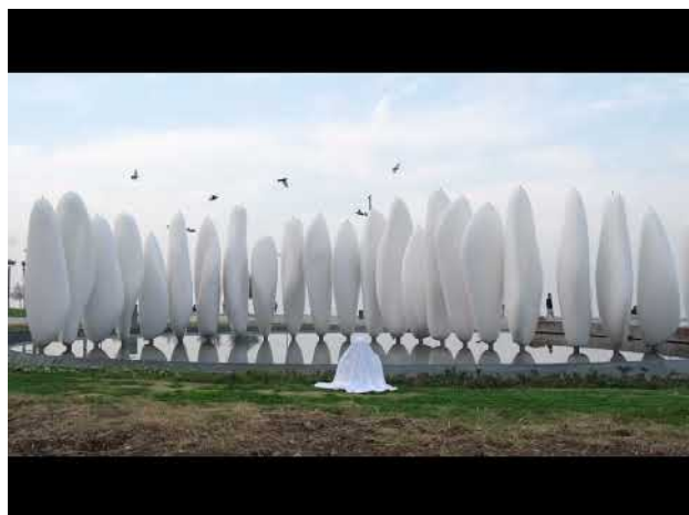
The Only Constant in Life is Change, 2022 03:13