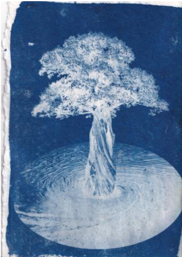
Feel free to talk to plants, 2024 cyanotypie