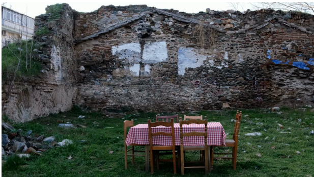
The return is but a distant dream, 2024 04:09

2022 R2I Ithaca, Greece www.return2ithaca.gr/