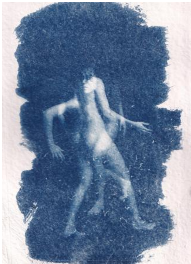
Feel free to talk to plants, 2024 cyanotypie