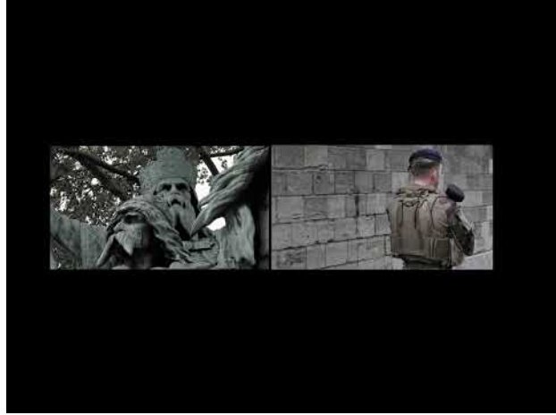
Voices from past, 2023 4:57