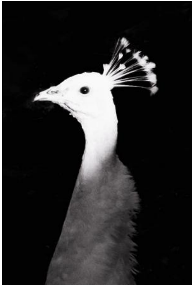
The Red Wine Sea, 2022