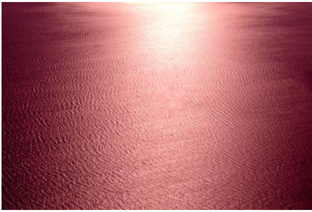
The Red-wine sea, 2022