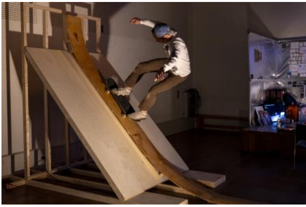
For the good that I would, I do not, 2024 maple, birch, pine, 8.5 x 2.5 x 2.5m