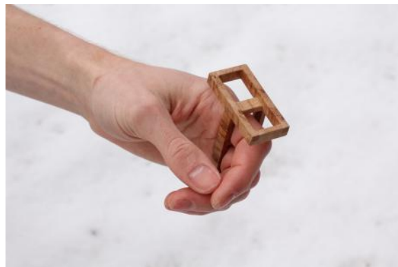
This one's for you, 2022 maple, steel, 6.5 x 6 x 3cm