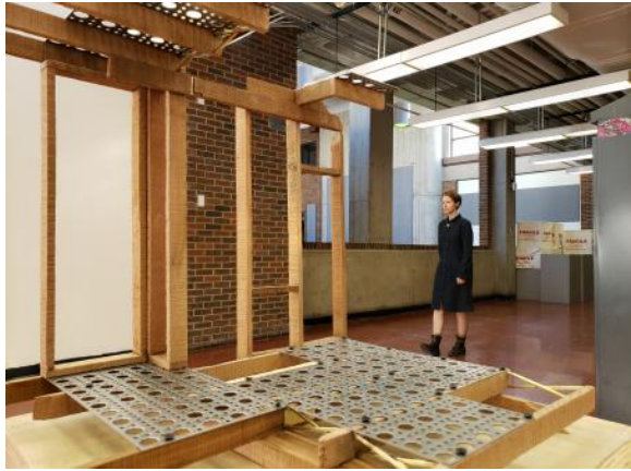
Renovation Site, 2019 cedar, steel, brass, 25 x 36 x 25cm