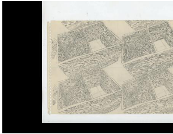
casework assembly line, 1/4 composition, 2024 hand-drawn animation, 23 x 15cm