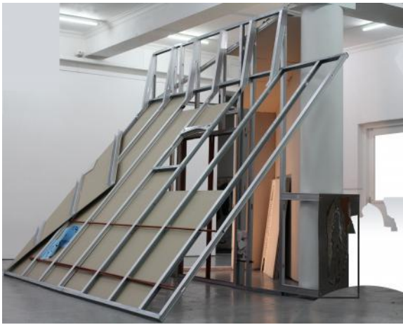
Let Up, 2023 installation, 4 x 4 x 3m