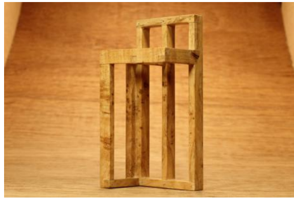
Head in the clouds, 2022 maple, steel, 11 x 5.5 x 4cm