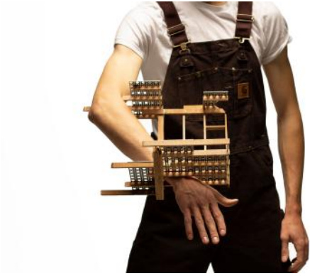
Renovation Site, 2019 cedar, steel, brass, 25 x 36 x 25cm