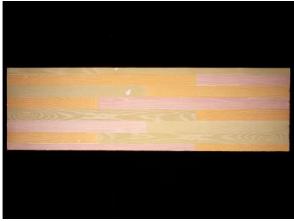
Sherbet Oak Flooring, 2020 lithograph, woodblock print, 56 x 173cm