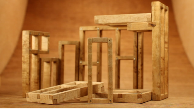
The Knuckle Dusters, 2022 00:03:16