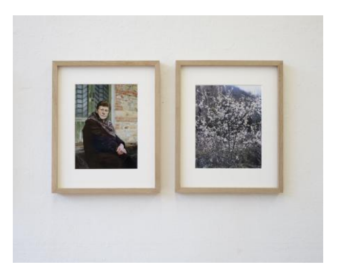
Her Forest, Tearless as Stone, 2024 Photography, C-print, 40x50 cm