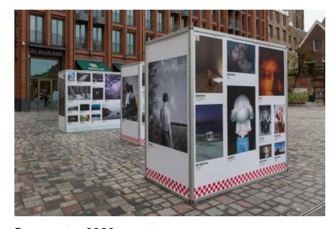
Regenerate , 2023 Photography