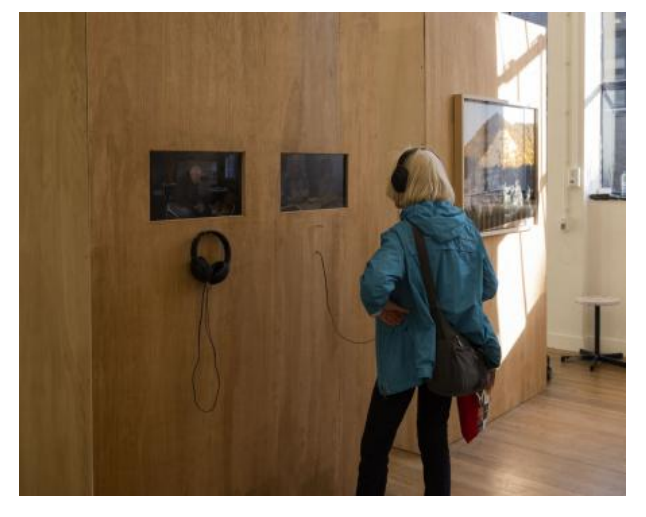
Her Forest, Tearless as Stone, 2024 Video