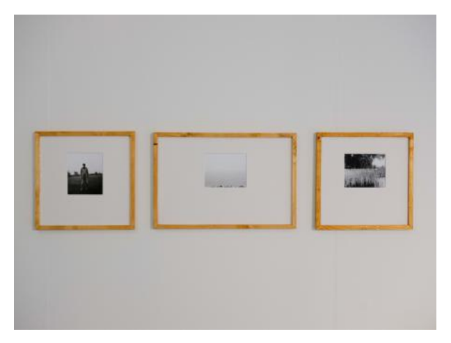
Mountain Never Meet but People Do, 2023 Photoraphy, 40x40 - 40x60 cm