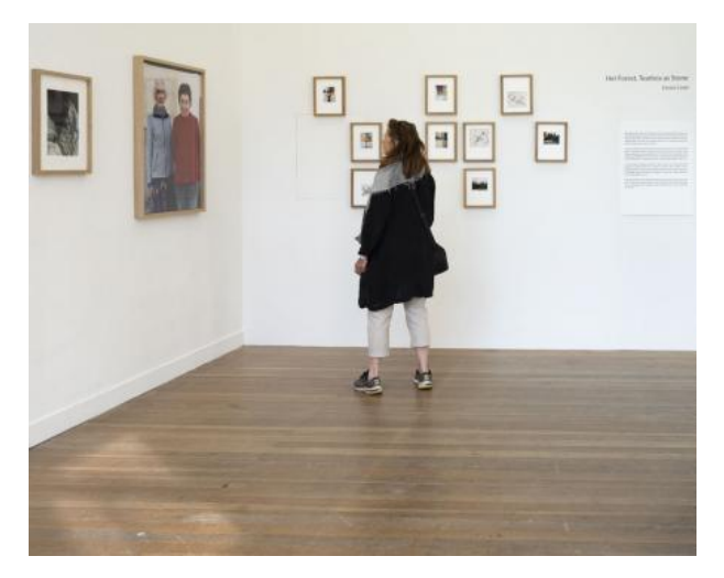
Her Forest, Tearless as Stone, 2024 Photography, C-print