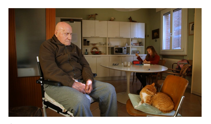
Cat Bath , 2021