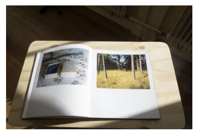
Her Forest, Tearless as Stone, 2024 Photobook