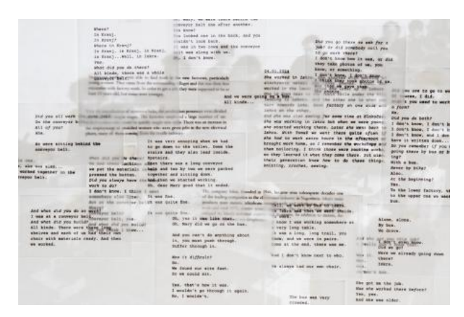
In the mountains, the sun is shining, 2024 Collage