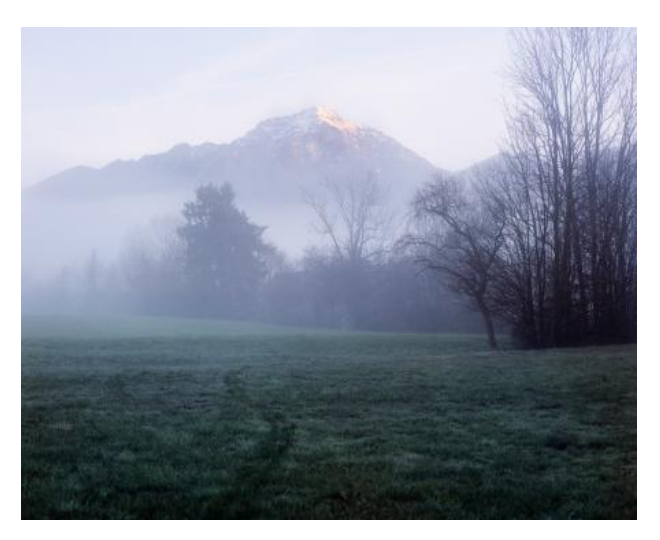
In the mountains, the sun is shining, 2024 Photography