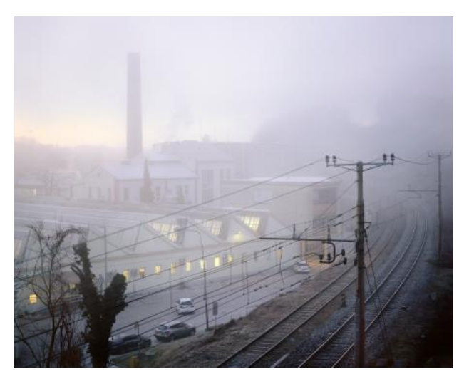
In the mountains, the sun is shining, 2024 Photography