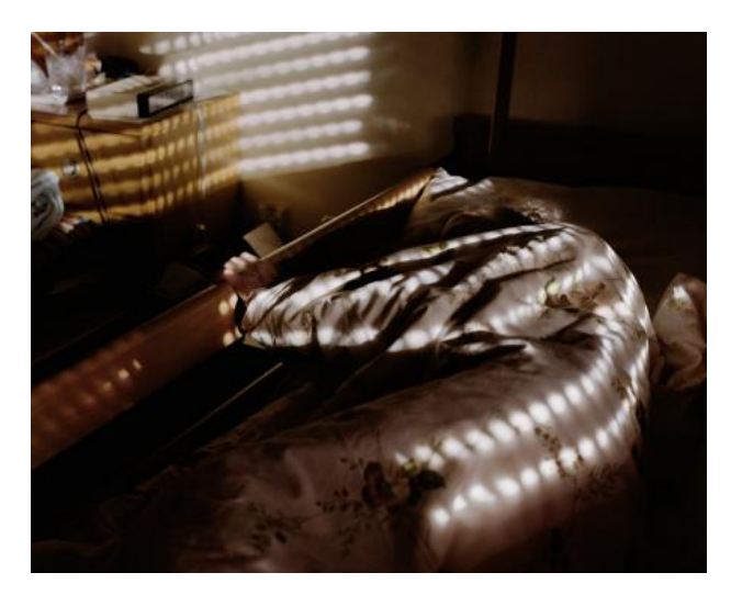
In the mountains, the sun is shining, 2024 Photography