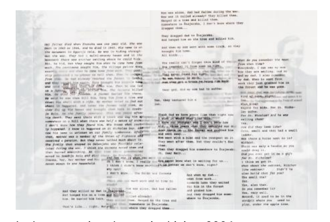
In the mountains, the sun is shining, 2024 Collage