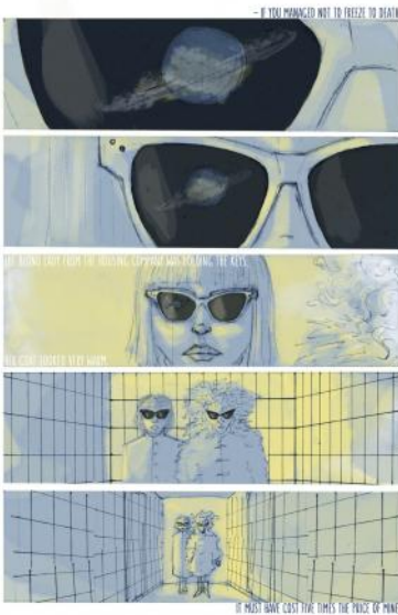
FAR FROM IT [comic book], 2024 pencils/hand drawing, digital colouring , 17cm x 22cm