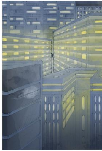
FAR FROM IT [comic book], 2024 pencils/hand drawing, digital colouring , 17cm x 22cm