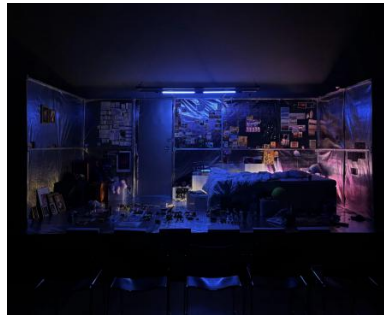
FAR FROM IT, 2024 set design, stage lighting, audio, length: 5,5m x width: 2,60m x 2,40m

2016 Where I Reside Chania, Greece Poster Design: photo exhibition from Λ.Ε.Φ.Κ.Ι photography and film educational space in Chania, Grece. www.lefkichania.gr/nea-ekdiloseis/136-photography-exhibition-ekei-pou-katoiko finished