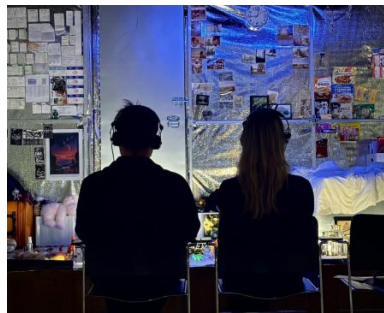
FAR FROM IT, 2024 set design, stage lighting, audio, length: 5,5m x width: 2,60m x 2,40m