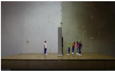
(Moerwijk) Model Museum, 2023