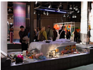
DDW / Class of '24, 2024 set design, stage lighting, audio, plot 3.60x2.00 m