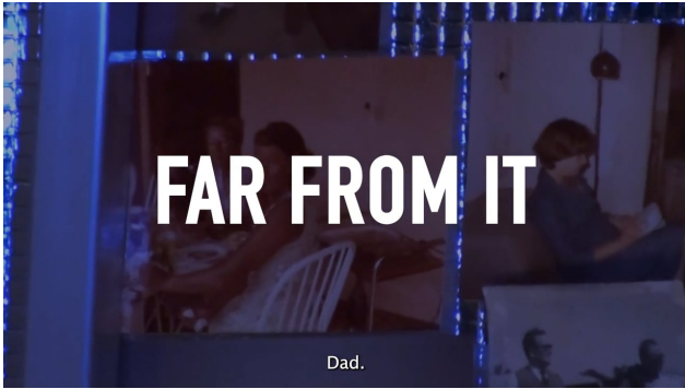
FAR FROM IT // Teaser Trailer, 2024 1:48