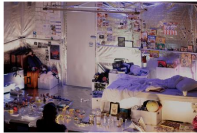
FAR FROM IT, 2024 set design, stage lighting, audio, length: 5,5m x width: 2,60m x 2,40m