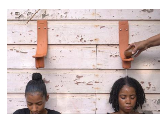
Un Enkuentro di Lombrishi ( (An Encounter Between Navels), 2024 Performance and Ceramics, Dimensions Variable