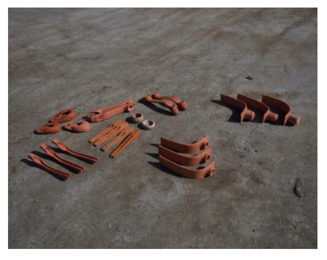
Ongoing ceramic series, 2024 Ceramics, Dimensions Variable

<u>burostedelijk.nl/manifestations/11/</u> Group