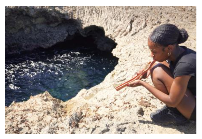
Un Enkuentro di Lombrishi (An Encounter Between Navels), 2024 Performance and Ceramics, Dimensions Variable