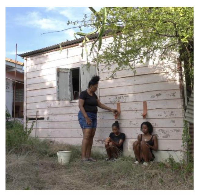
Un Enkuentro di Lombrishi (An Encounter Between Navels), 2024 Performance and Ceramics, Dimensions Variable