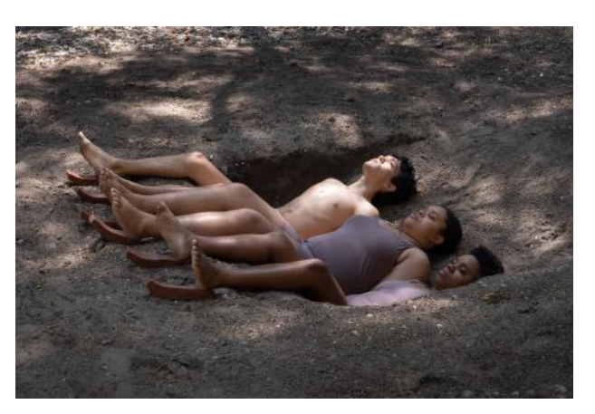
We Shared a Belly , 2023 Performance and Ceramics, Dimensions Variable