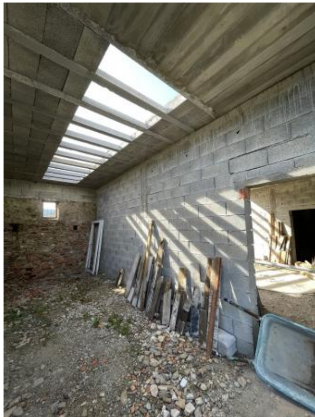
7 Halos , 2023 time-based light installation , Dimensions variable