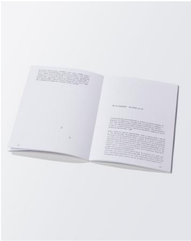
Water Wings; Topophilia towards the surfaces, 2024 laser print on paper, a5