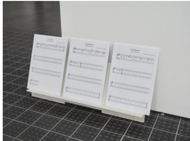
Blade pitch scores 1,2,3,4,5,6,7,8,9,10 , 2024 laser print on paper, Korg notation stand, foam board , 1,0m x 0,40m