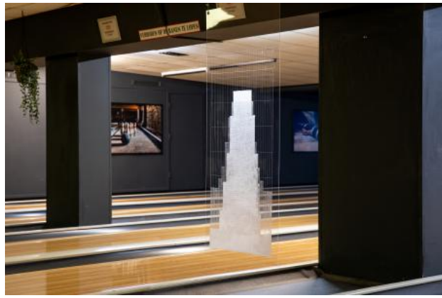
A Beaten Path, 2024 Hand engraved plexiglass