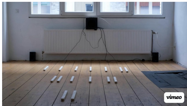
Hear----from----you---soon----, 2023 00:17