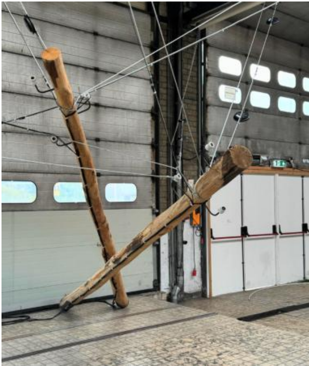
50Hz Conference Call , 2024 12-channel audio installation. electricity poles, insulators, steel wires, conference speakers, mp3 players, steel, aluminium. , 4m x 6m