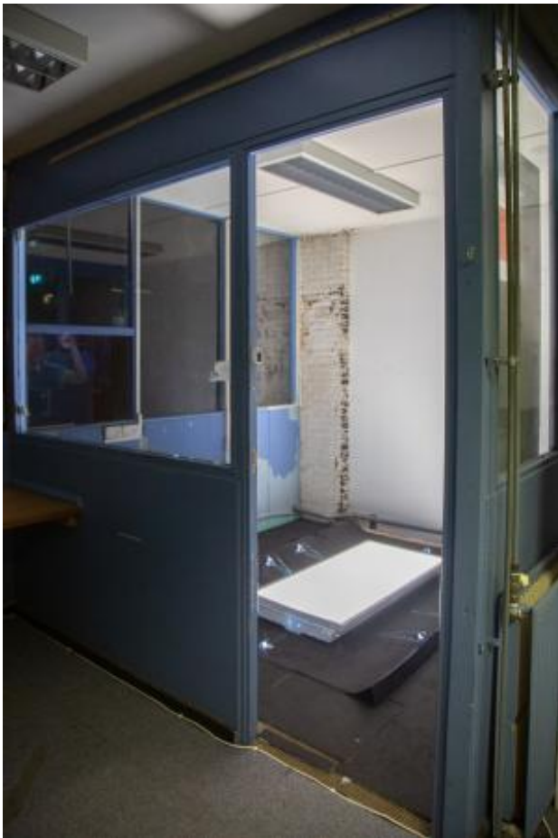
Polaris, 2023 LED lights, Fluorescent light, Car Carpet, UV Protection film, Aluminium, steel, Hand carved glass, Dimensions variable