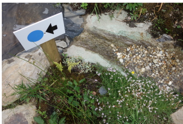
Garden of Microclimates, 2018 mixed media, 11x7x4m