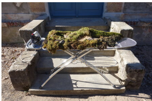
Microclimates Take Over, 2020 mixed media, 1.50x1 m

2004 - -- OpTrek, tentoonstelling 'Stand van Zaken 4', lezingen en performances, Stroom Den Haag