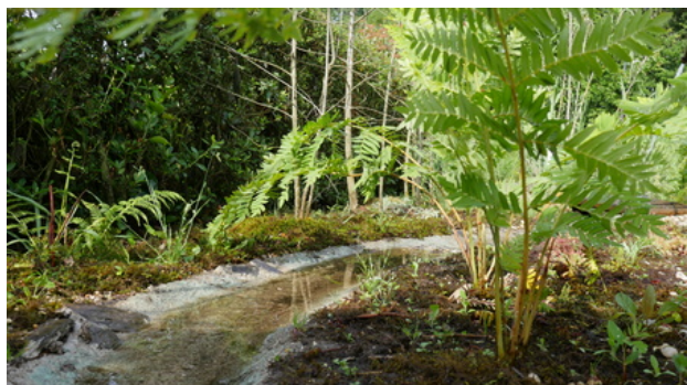
Garden of Microclimates, 2018 mixed media, 11x7x4m