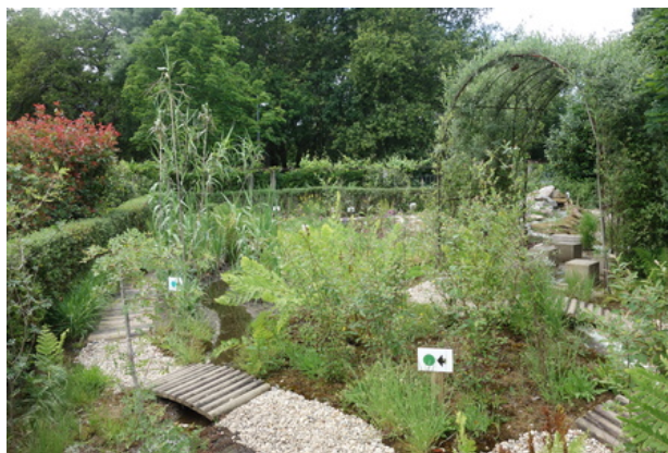
Garden of Microclimates, 2018 mixed media, 11x7x4m