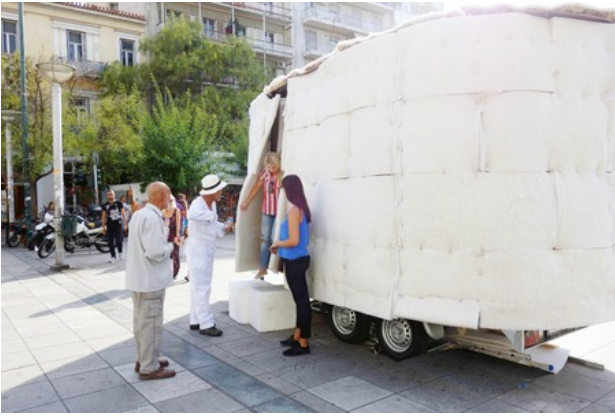
Microclimatic Heat Shelter, 2018 mixed media, 7x4x3.5m