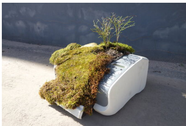
Microclimates Take Over, 2020 mixed media, 0.50x0.60m