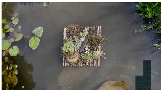
Garden of Microclimates, 2018 mixed media, 0,40m