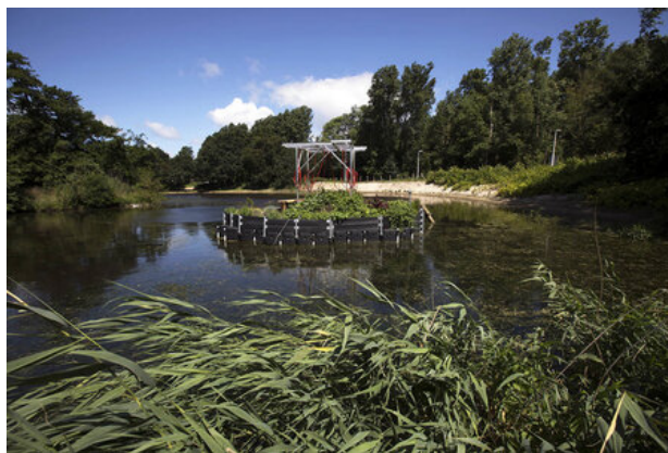
OasISH Island, 2018 mixed media, 7x6x4m