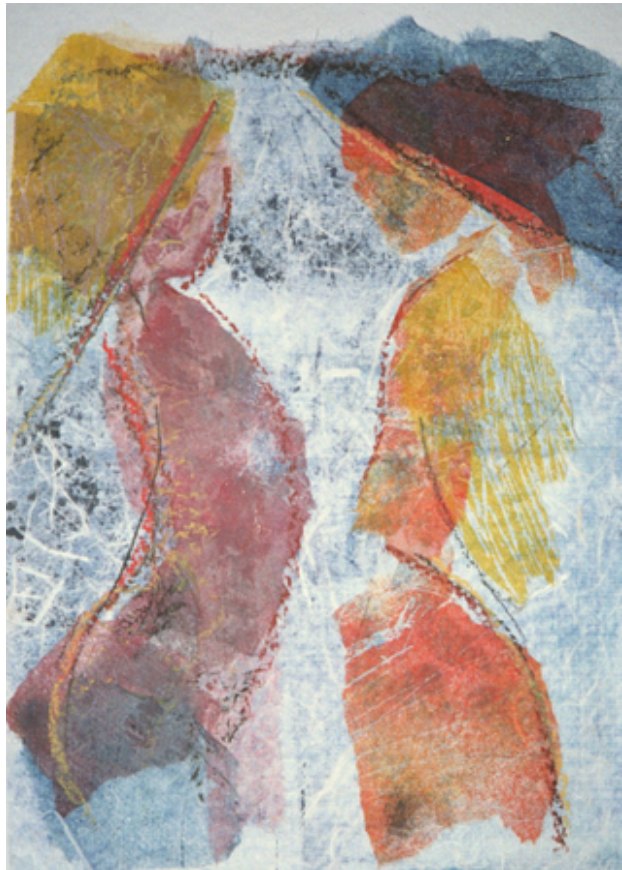
entre nous chigiri-e, 55 x 85