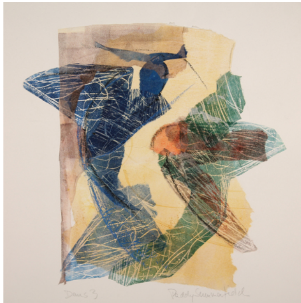
dans, 2016 chigiri-e, 50 x 55