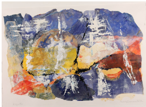
Regatta, 2007 gemengde met chigiri-e, 100 x 85 cms