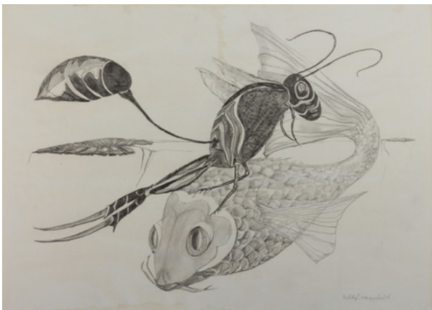
two dimensions drawing, 75 x 50