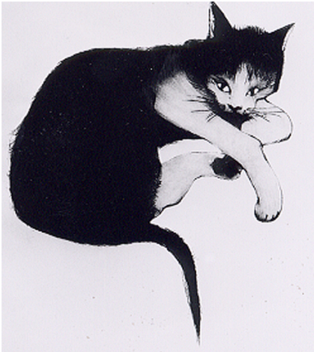
Mooch etching, 48 x 50