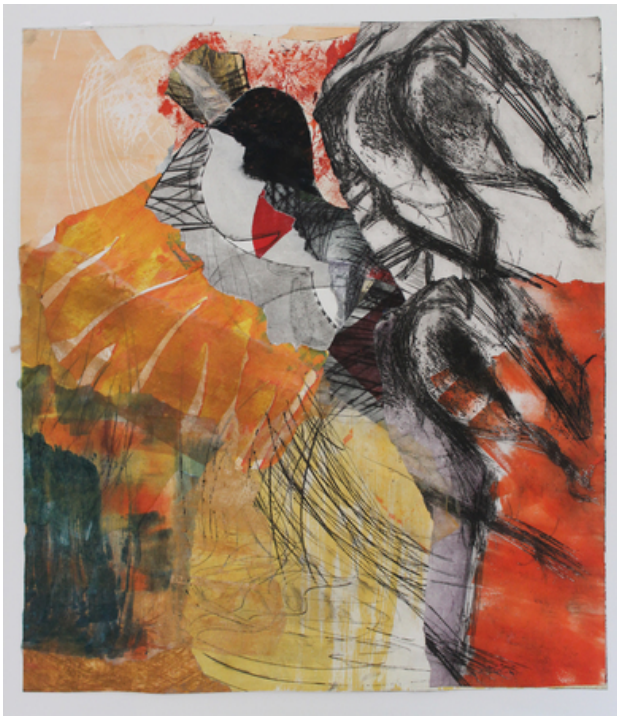
circus rider, 2017 collage of etched paper, 70 x 75